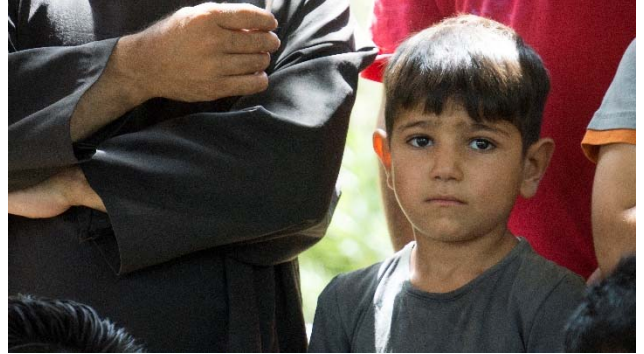
A Yazidi boy listens as refugee men tell tales of suffering

A group of Yazidi refugee men from Sinjar Mountains in Iraq shared their fears with me under the shade trees in a refugee camp in southeast Turkey in July 2015. They are among the 4,000 refugees in the camp. It was less than one year ago that they were brutally attacked by Islamic State (IS) forces. Those who survived escaped to northern Iraq and southeastern Turkey with the help and protection of Kurdish Workers Party (PKK) forces. Many of their children and wives were abducted by IS forces. Their fate is unknown.