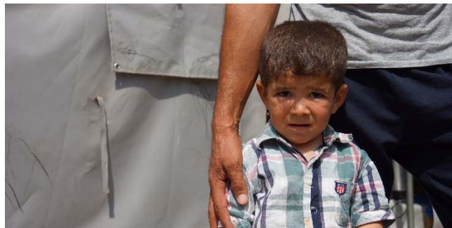
A Yazidi orphan in a refugee camp in Turkey